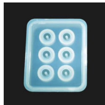
Resin Crafts Mold