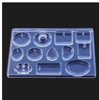
Resin Jewelry Mold